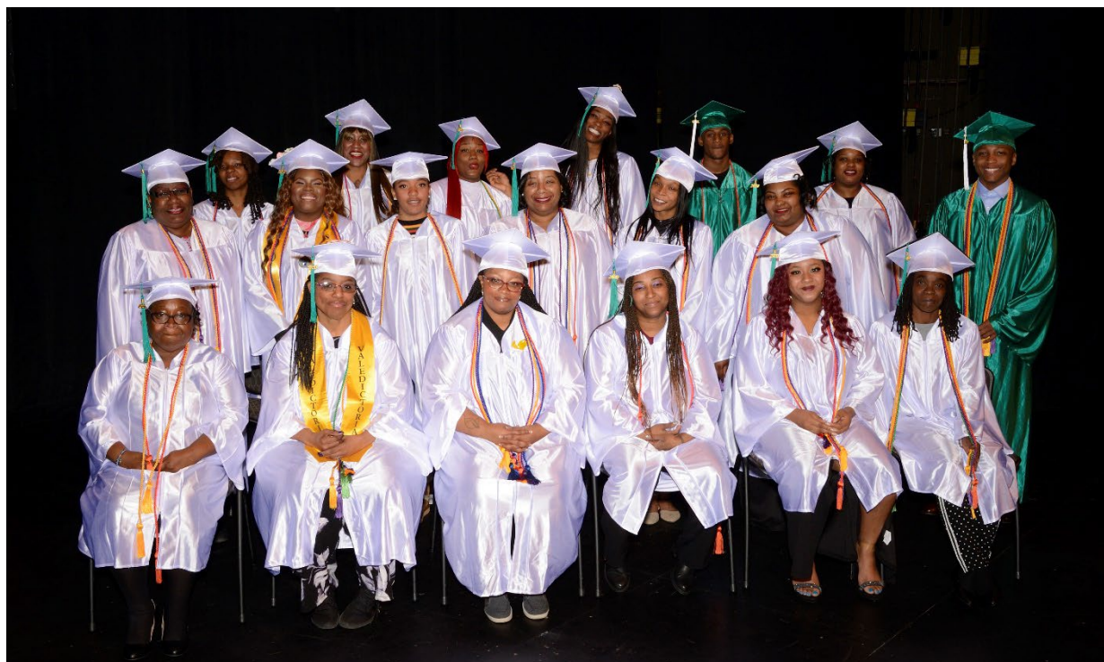
↑ Class of January 2020